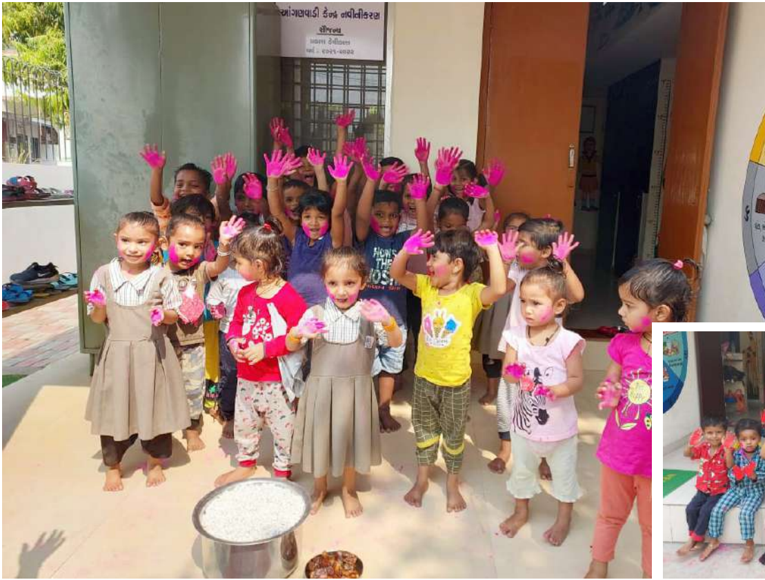
Holi Celebration at Adopted Anganwadi Centers