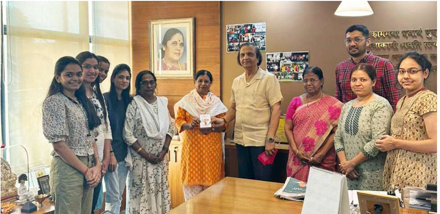
Women's day Celebration at "Prakash House"